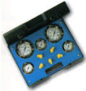
Portable Hydraulic Instruments for testing Pressure