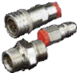
Stainless Steel Test Coupling and Quick Coupling