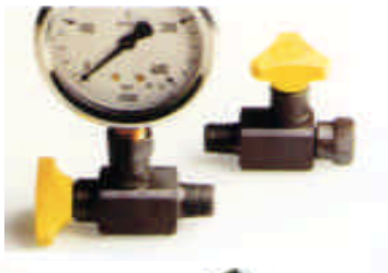
Pressure Gauge anti- shock valves