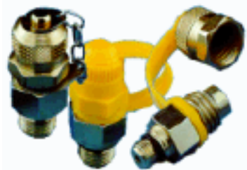
Test Coupling for Pressure Checking