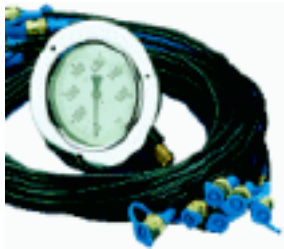
Micro Hose for High Pressure and Fittings