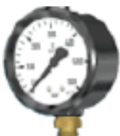
Stainless Steel case Pressure Gauges Glycerine filled

For further information please ask for catalogue HT 66